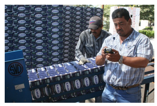
Recording Labor at Lagomarsino - CA

After spending many years manually keying data into the accounting system,