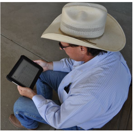
Supervisor Reviews Employee Performance in real time

PET Tiger eliminates the problems of recording payroll data with a pen and paper, especially when various fields are spread out over great distances. The payroll data collection